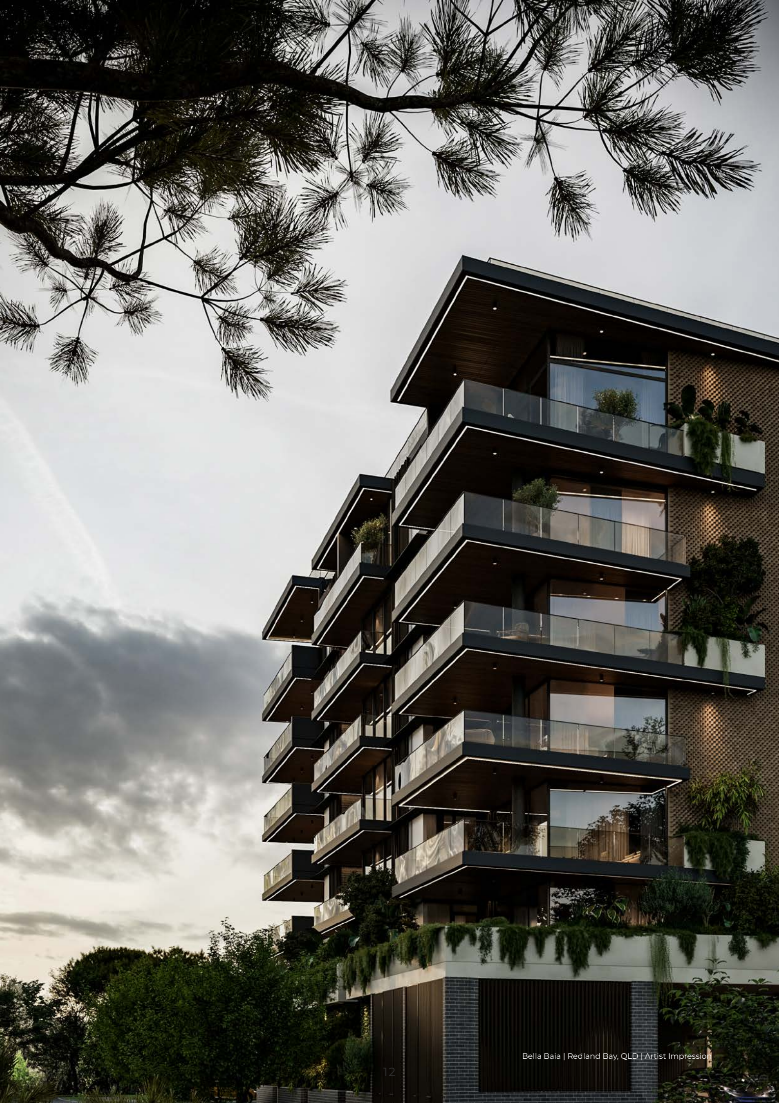
Bella Baia | Redland Bay, QLD | Artist Impression