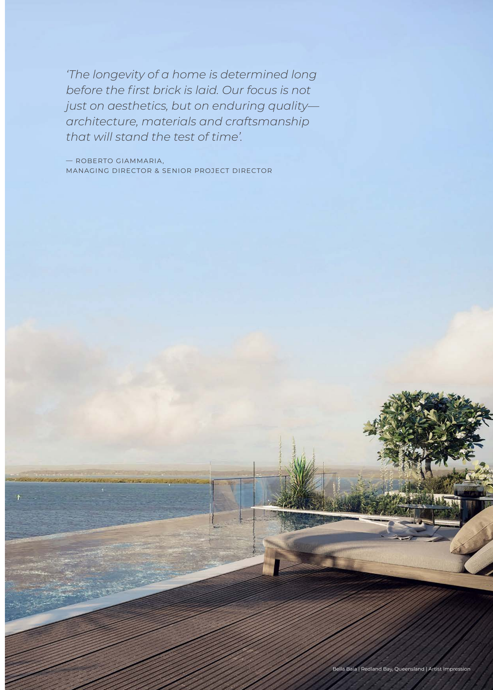
Bella Baia | Redland Bay, Queensland | Artist Impression