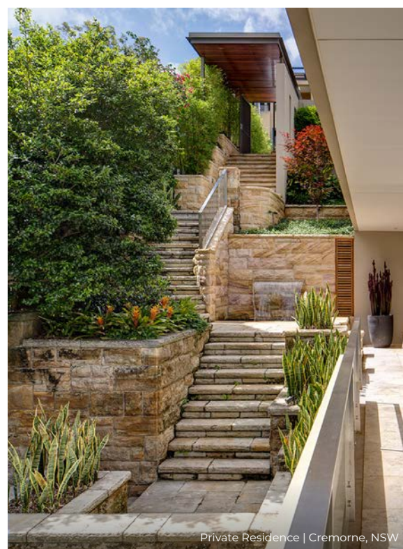
Private Residence | Cremorne, NSW

This 10-year post-completion warranty safeguards your apartment against hidden structural defects that may not be immediately apparent. By choosing a development protected by LDI, you ensure your investment is secure, providing peace of mind and potentially reducing future repair costs.