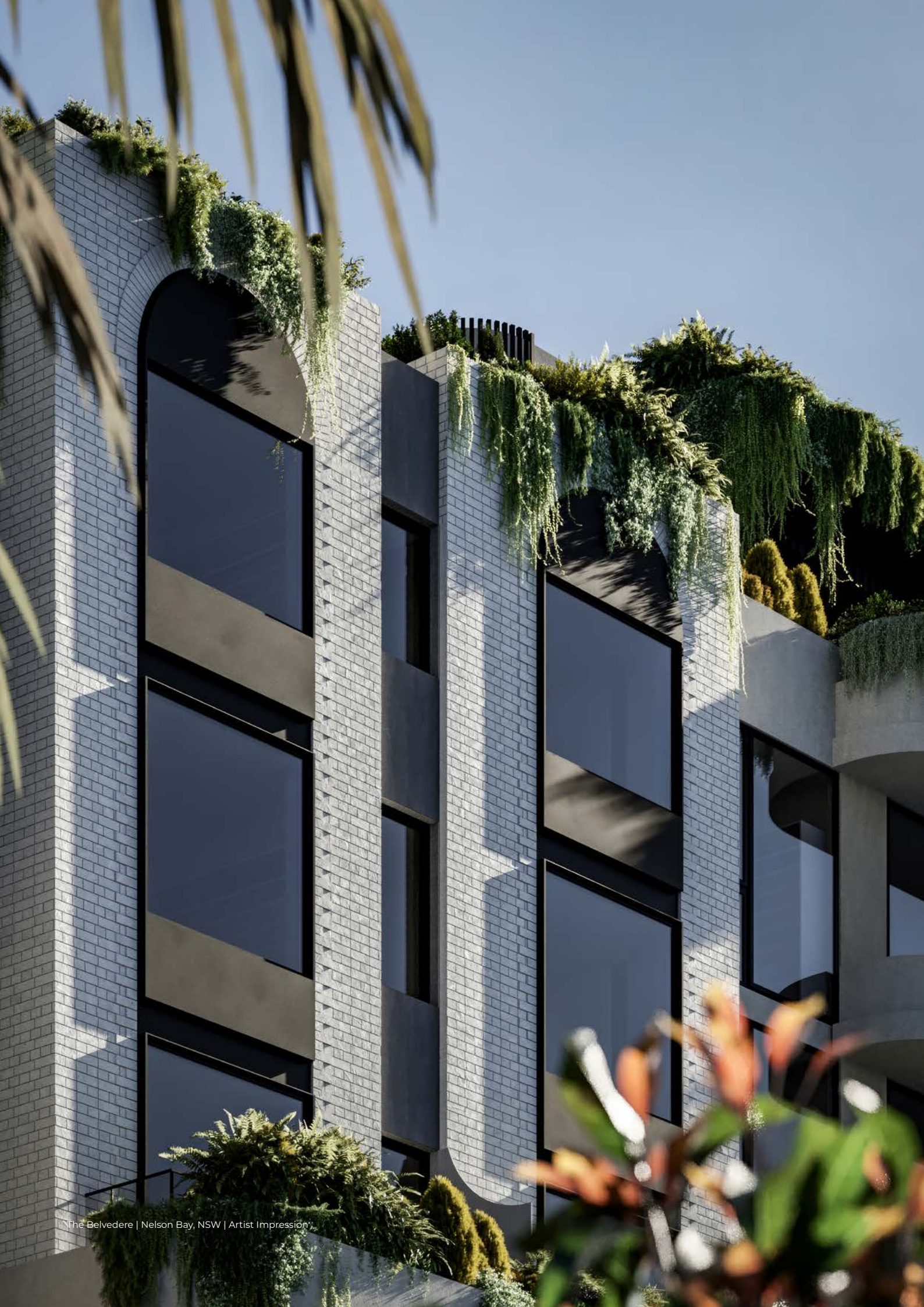
The Belvedere | Nelson Bay, NSW | Artist Impression