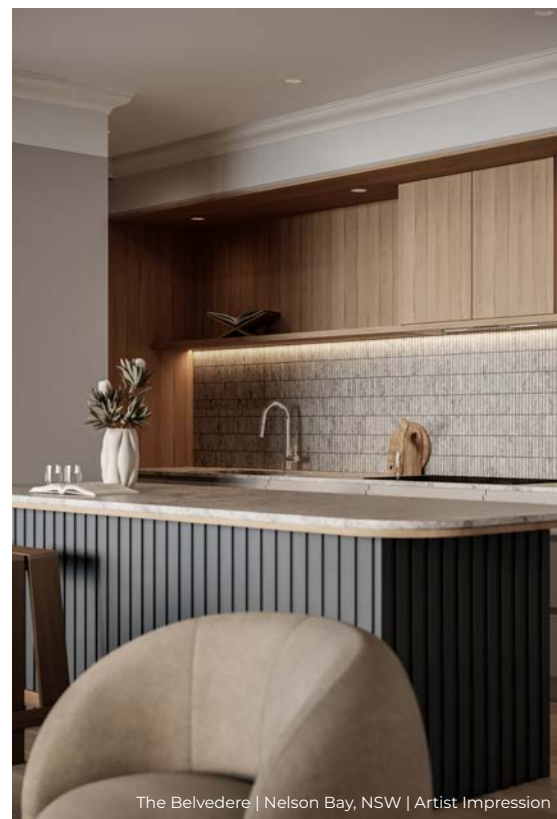
The Belvedere | Nelson Bay, NSW | Artist Impression

Buying off-the-plan means securing your apartment at today's price, before the market moves. If property values rise, your apartment could be worth significantly more by settlement, giving you an instant equity boost.