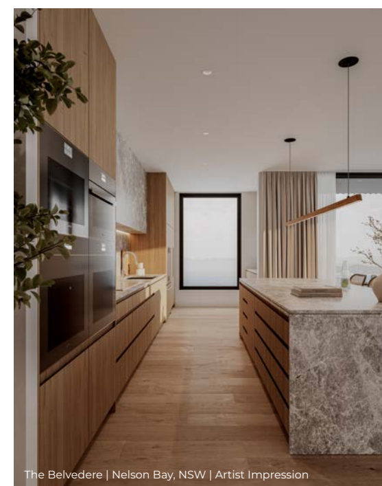
The Belvedere | Nelson Bay, NSW | Artist Impression

With deposits starting as low as 10%, you can secure a luxury apartment with minimal upfront capital, freeing up your funds for other investments or financial goals.